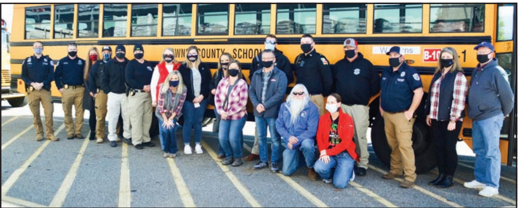
Hiawassee PD received plenty of volunteer support from good-hearted folks wanting to treat kids to an extra special Christmas shopping experience Friday.